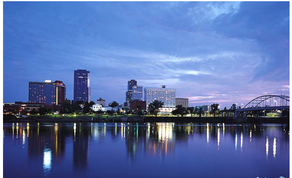
Little Rock skyline

I look forward to seeing you in Little Rock! If you have any questions about hotels or things to do while in Little Rock please email me at kheintz@pulaskitech.edu .