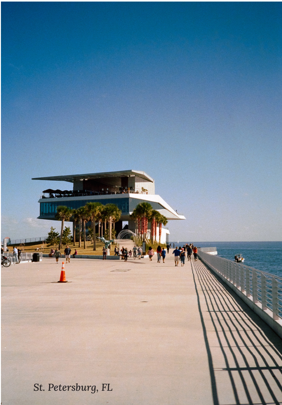
St. Petersburg, FL

Long Live The Southern States Communication Association!