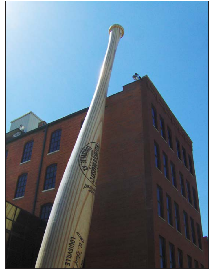
Louisville Slugger Museum

Whatever days, panels, visiting, and expeditions await you, and whatever rewarding personal, sightseeing, or scholarly moments your convention choices lead you to, I gleefully anticipate seeing all in Louisville!