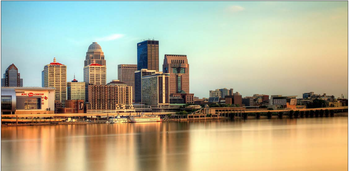
Downtown Louisville by Scott Oves/CC BY 2.0