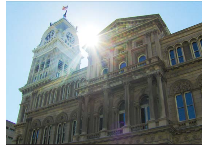
City Hall Clock Tower

addition to the warm and gracious hosts and company, the setting adds a sense of old world mystery, as we will gather in the "Rathskeller" for the event.